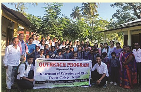
The Education Department in collaboration with the IQAC organised a community outreach programme on 22 nd November 2024 at Usha Kalibari Junior Basic School