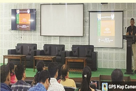
The National Constitution Day was celebrated by the Department of Political Science in collaboration with IQAC, Tezpur College on 26 th November, 2024.