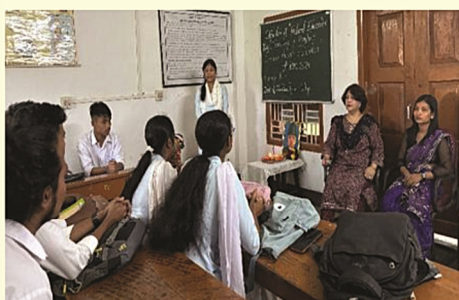
A Speech competition, showcasing the knowledge of Maulana Abul Kalam Azad was organised by the Dept. of Education to celebrate the National Education Day.