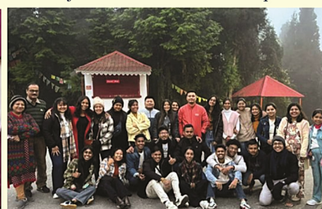
A group of students of B.A. 5 th Sem, from Dept. of Geography embarked on an educational excursion to Sikkim on 19 th Oct.2024.