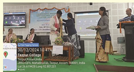
ICSSR-NERC sponsored the National Seminar on "Environment Imagining in North-east India: Literature, Cultural and Beyond" organised by the Department of English in collaboration with IQAC, Tezpur College on 30 th Dec. 2024.