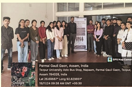
Department of Physics, Tezpur College, participated in the Women Empowerment – Career Opportunities in Science (IDE-COS) program held at Tezpur University on 19/11/2024.