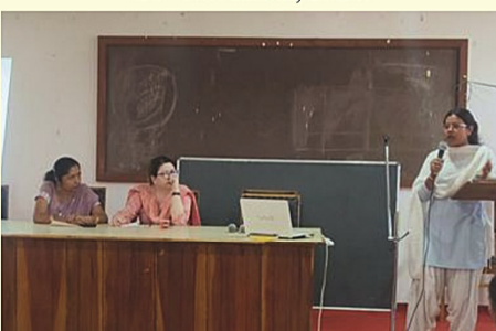
One Day Workshop on Debating skills held at Tezpur College.