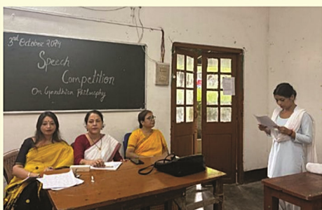
Speech competition among the students of Philosophy Department on the occasion of Philosophy Day on 21 st November, 2024.