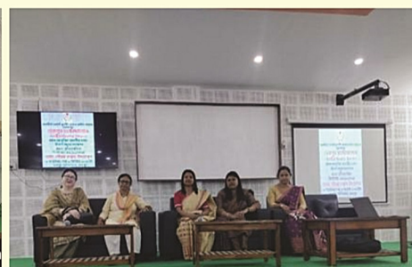
Celebration of "Bhakha Gourav Hoptah", at the college premise.