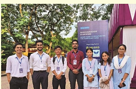
Dept. of Physics, participated in the Semiconductor Ecosystem: Awareness & Opportunities for Northeast India, a one-day workshop jointly organized by Jagiroad College, NEISED, and NIELIT, Guwahati on 25 th Oct.2024.