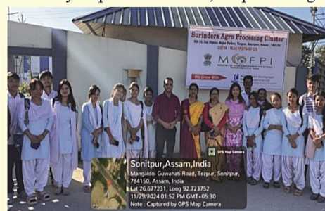
Students of Economics Department, Tezpur College, visited a Agro Processing Cluster on 29 th November, 2024, as part of their practical learning experience